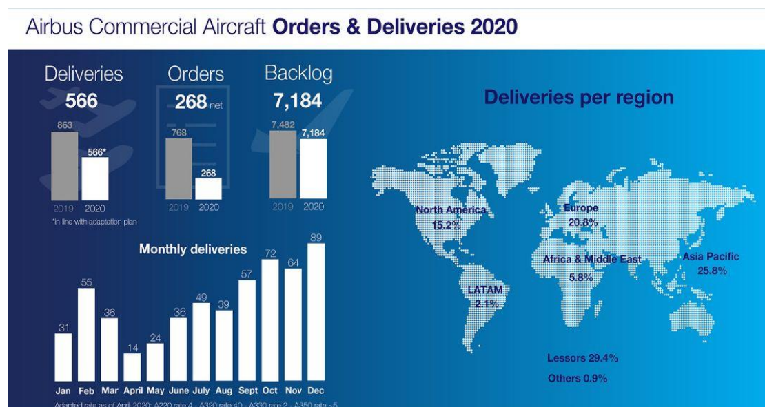
Figure 1. Airbus Commercial Aircraft Order and Delivery

Figure-1 depicts the number of delivered aircraft in the years 2019 and 2020, also it talks about the number of orders received, pending status, the number of aircraft delivered in a month and lastly, it gives an idea of aircraft order distribution over the continents.