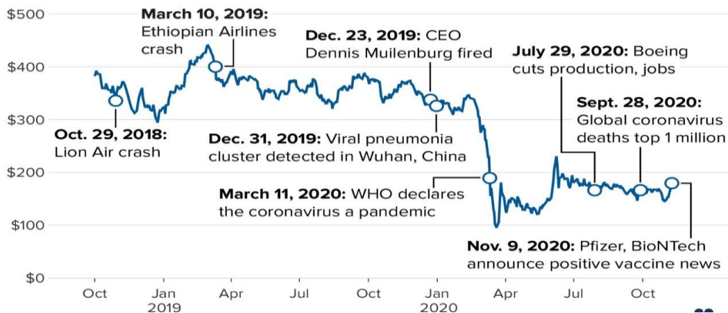
Figure 3. Boeing during the pandemic

Figure-2 gives us an idea of Boeing's loss since 1997. As the company was growing exponentially since 1997 but it started to experience losses after 2018. Figure-3 says about the stock price of Boeing from Oct 2018 to Oct 2020 and there's a drastic fall in the prices due to the impact of covid 19.